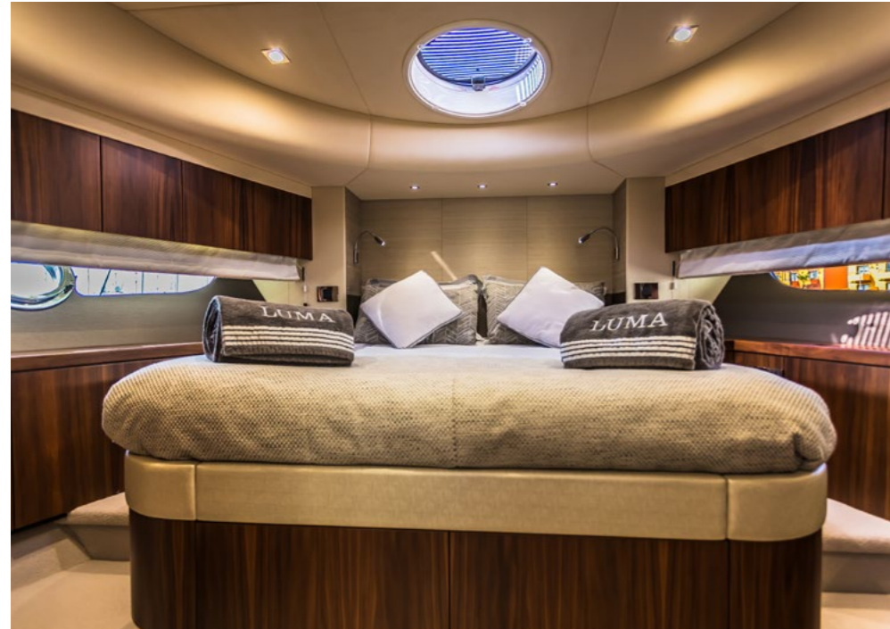
Forward VIP stateroom