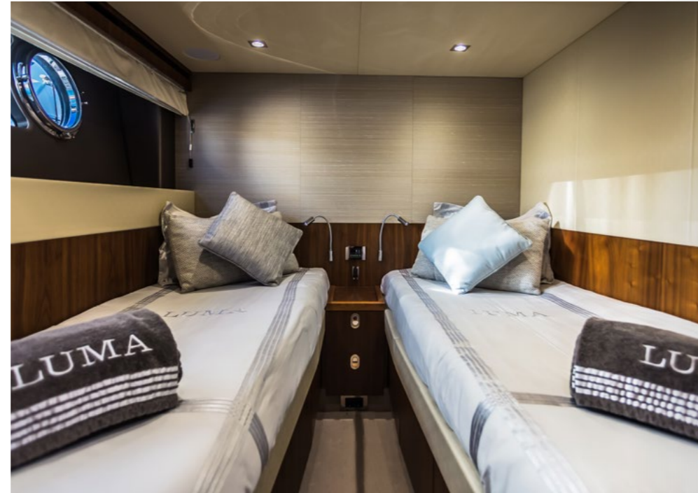
Twin guest cabin