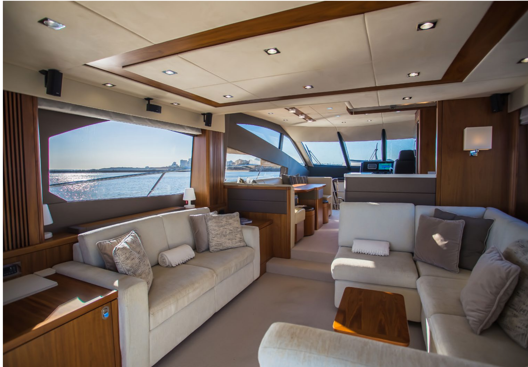
Main deck saloon