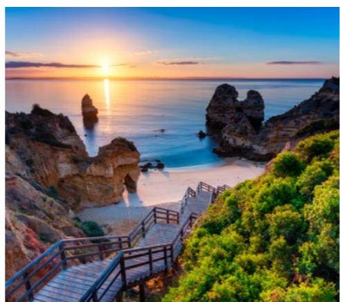
The stunning Algarve coast