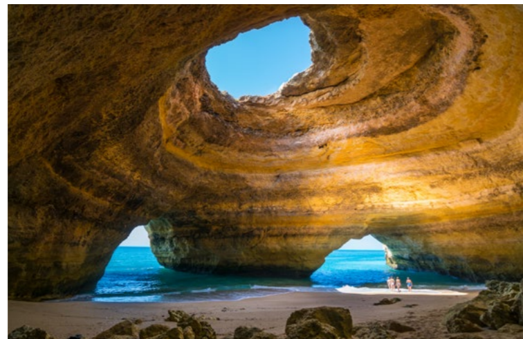
Benagil cave in Carvoeiro

Head West to Sagres - A charming historic town. Safe to sail close to the cliffs and enjoy empty beaches and coves. Last anchorage before Cape St. Vincent for passage north. You can enjoy a lovely meal in Sueste Restaurante.